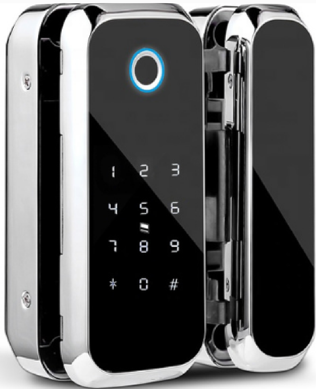
Model : E15