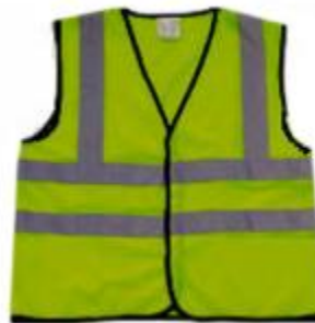
N404-G (Yellow green with gray reflector, black lining, mesh)