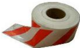
Red and white stripes (3"x 1000 feet)