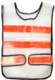
N413-O (white with orange reflector and side strap, mesh)