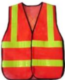
N409-O (Orange with yellow reflector, x-back, mesh)