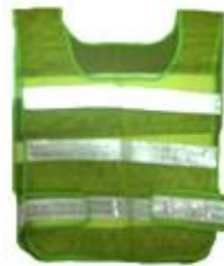
N410-G (Green with white reflector)