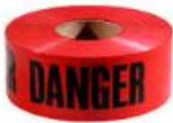
Danger (3" x 1000 feet)