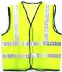
N409-G (Green with white reflector, x-back, mesh)