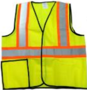
N412-G (Y. Green with orange / gray reflector with pocket and zipper, poly)