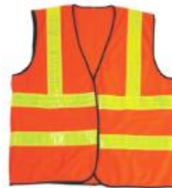
N411-O (Orange with yellow reflector, poly with or without zipper)