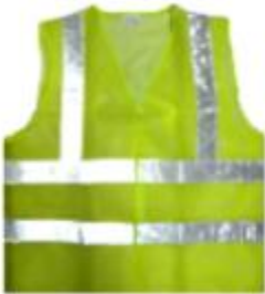
N402-G (Yellow green with white reflector, poly, x-back)