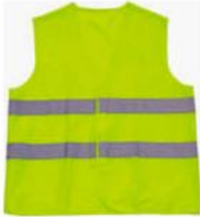
N408-G (Y. Green with gray reflector, poly)