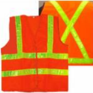
N402-O (Orange with yellow reflector, x-back poly)