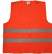
N403-O (Orange with gray, economy, poly)