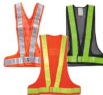
N406-OY (Orange with yellow reflector)