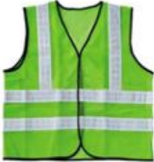
N411-G (Green with white reflector, poly)