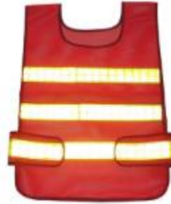
N410-O (Orange with yellow reflector and side straps, mesh)