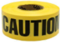
Caution (3" x 1000 feet) (3" x 500 ft)