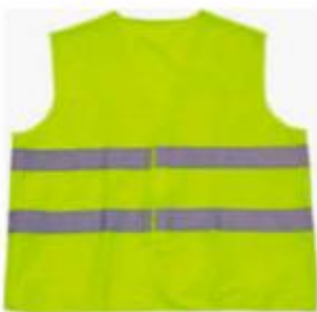
N403-G (Y. green with gray reflector, economy, poly)