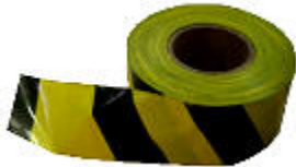
Black and yellow stripes (3"x 1000 feet)